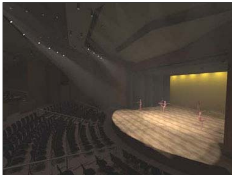
Rendering of a St . Louis high school theatre, a project on which