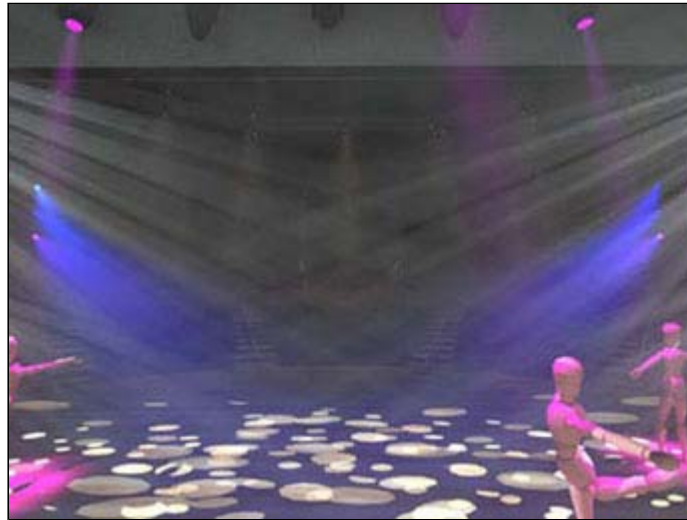
Rendering of St. Louis high school theatre